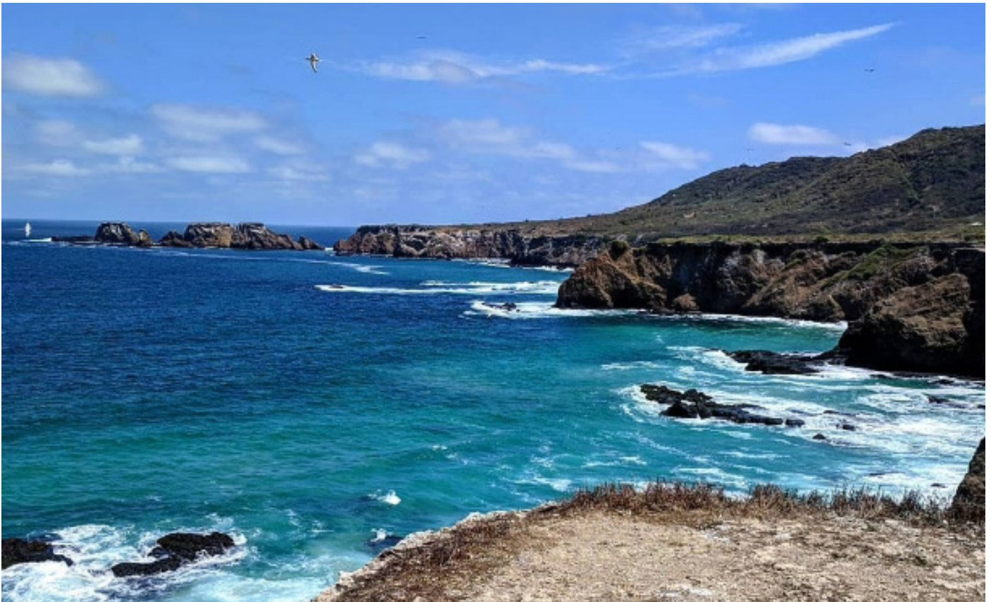
Isla de la Plata.

Tectonic deformations, and in particular vertical movements, recorded by the coastal domain above the Ecuadorian subduction zone reflect a complex geological history. These vertical movements can be quantified at different time scales, at the short-term from the scale of the seismic cycle to many cumulated cycles (100 ka) to the long-term (Ma) by combining tectonic markers. In this fieldtrip, we propose to explore vertical movements through morpho-tectonic markers of coastal uplift (uplifted marine terraces) and sedimentary and stratigraphic markers of formation of the Coastal Cordillera (evolution of forearc basins). This fieldtrip will focus on Manta Peninsula and La Plata Island. The observed markers will be placed in their seismic, tectonic and geological context. Please note that this fieldtrip will be done in spanish.