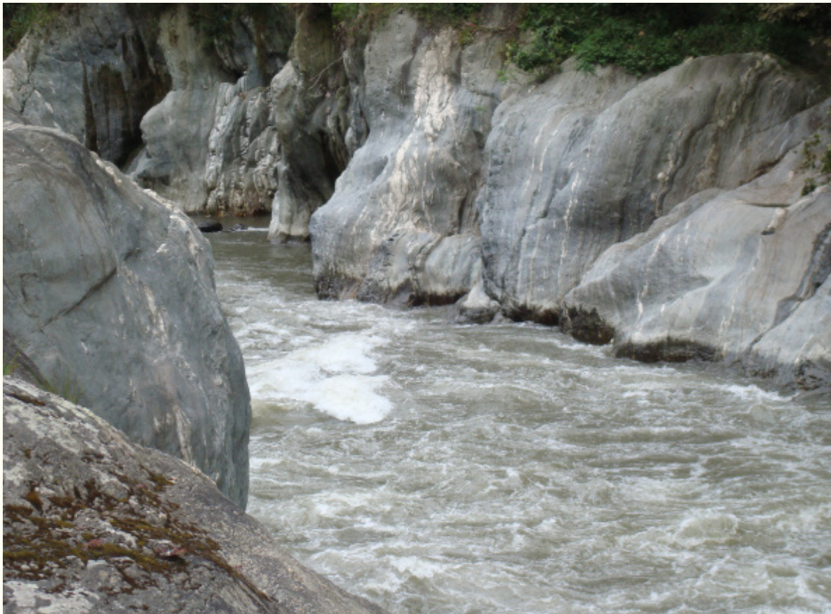
Sheared metasedimentary rocks of the Alao-Paute Arc, unconformably overlain by basaltic lavas of Volcano Tungurahua. (Town of Baños).

The Eastern Cordillera of Ecuador is an Andean trending magmatic and metamorphic belt that exposes rocks spanning from the Palaeozoic basement to the modern active arc, and records the early disassembly of Pangaea in the Triassic, subsequent prolonged Jurassic - Early Cretaceous active margin magmatism during hyper-extension, and the collision and accretion of the Caribbean Large Igneous Province in the late Cretaceous. The field trip plans to make the following stops: (1) Ammonite bearing quartzites and slates of the Chaucha Block, which is considered to be para-autochthonous continental crust that rifted from South America during Early Cretaceous hyper-extension (stop close to the town of Alausi); (2) The Pelitetec sequence, which is a tectonic melange that hosts ultra-mafic and mafic lithologies, which range in age from Neoproterozoic to Early Cretaceous, and is considered to have formed during the closure of an Early Cretaceous basin that was floored by a transitional mafic crust; (3) Tungurahua Volcano, which is part of the modern arc and has been continually erupting since 1999 until the mid-2016; (4) A west-to-east traverse across the Cordillera, where we will cross Triassic anatectites that formed during a rift-to-drift transition, and Jurassic-Early Cretaceous arc rocks that formed in a prevailing extensional setting.