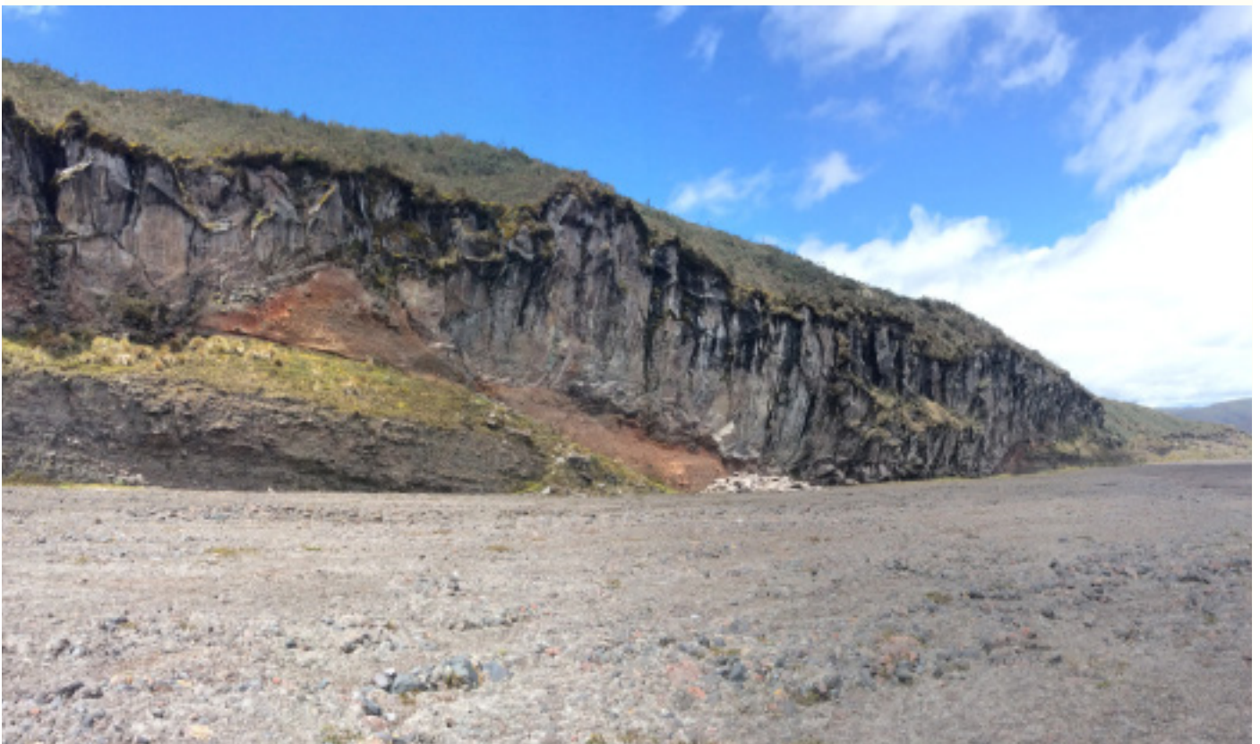
Lava flow from Cotopaxi Volcano.

Note: Participants are advised that we will be at high elevations, up to 4500 m above sea level (asl). Please be sure that your health is compatible with being at these altitudes. Above 3000 m asl, temperatures will generally be between 5 – 20°C; driving rain and strong winds are possible. Sunscreen, hats, and adequate clothing are necessities. Water and lunch will be provided in the field. The organizing committee will not be responsible for any accidents that might occur during the trip. Participants are recommended to have their own health and travel insurance.