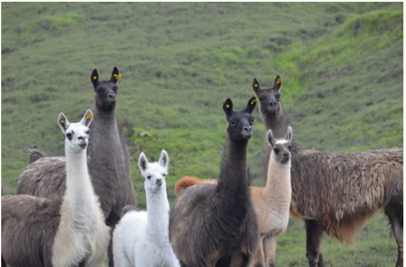
Ecuadorian llamas at Tungurahua volcano.

We hope this initiative will captivate your interest and you will come to participate and present your work at 8 th ISAG! This meeting will also allow renewing and strengthening the ties among researchers and institutions working in the Andes. Your presence will give relevance to the ISAG!