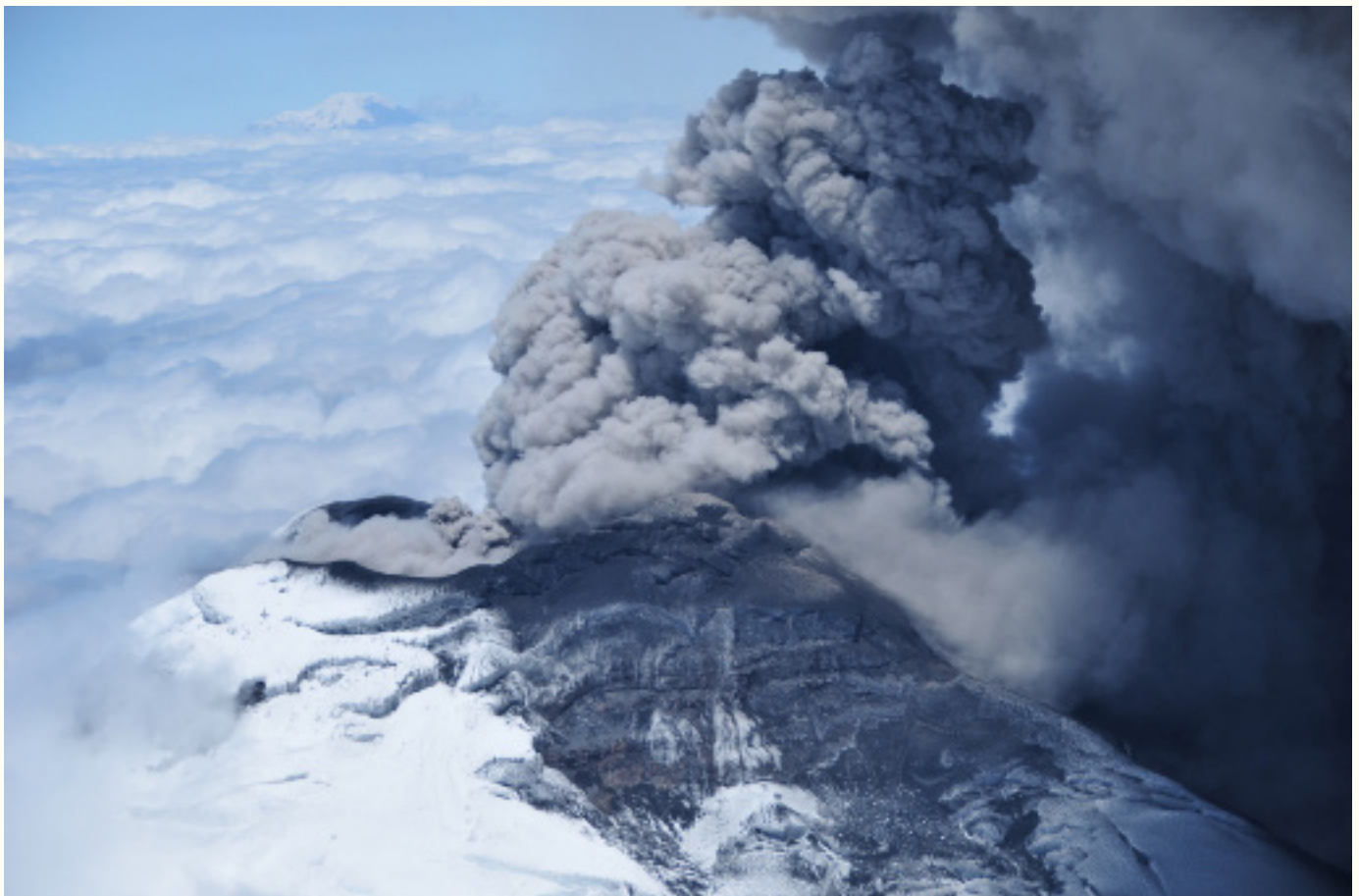
Ash emission from Cotopaxi volcano during the 2015 eruptive phase.

Cotopaxi volcano is one of the most active and iconic stratovolcanoes of the Ecuadorian Andes. Its history covers more than 0.5 Ma and includes the rhyolitic explosive deposits of its Pleistocene volcanic history, including the (~200 ka, 100 km 3 ) Chalupas ignimbrite. During this fieldtrip, we will also observe the eruptive products of the last 7000 ka, that includes rhyolitic tephra fallout and pyroclastic flow deposits, debris avalanche and lahar deposits, and the historical scoria flows and debris flows deposits.