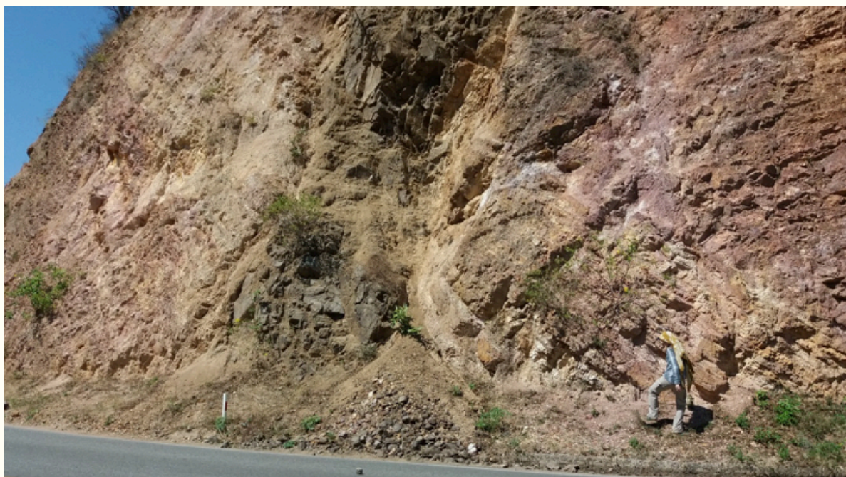
Volcaniclastics and sediments near Bramaderos porphyry with strong argillic to phyllic alteration, cutting by late mineral andesitic dykes. Outcrop in the pan american highway.

The aim of the field trip is go through the basin from the northwest area in the contact between metamorphic rocks and overlain sedimentary western domain toward the southeastern domain where dominated volcanism with porphyry and epithermal deposits are present on the upper sequences and ending in the lower basaltic sequences.