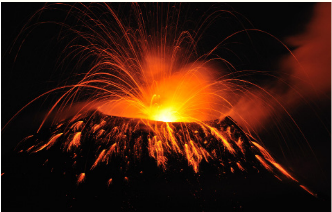
Strombolian activity at Tungurahua volcano.

For information about this event please contact: shidalgo@igepn.edu.ec or pablo.samaniego@ird.fr