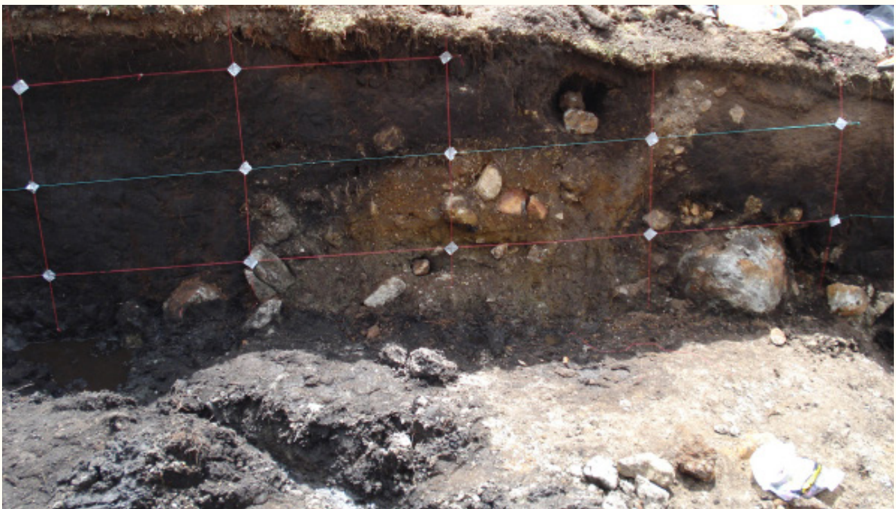
Trench studied at Pallatanga Fault.

During this 4-days field trip, we plan to present, among other short stops, the most prominent geomorphological and geological evidences of fault activity along this system, including surface ruptures associated with moderate and large magnitude earthquakes. We will have a look at Quito fault zone (Alvarado et al., 2014), then drive to the south in order to get an overview of recently studied active faults. We will have a look at the Pallatanga fault in Rumipamba where the first trenches in Ecuador were performed to find back the source of 1797 M7.5+ Riobamba earthquake (Baize et al; 2015) and drive uphill to the Pisayambo Laguna area where a M5 earthquake ruptured the fault system up to the surface (Champenois et al., 2017). We will also make a detour to the Igualata volcano summit (4500m) to observe a surface rupture, which is probably associated with the major Riobamba earthquake (Baize et al., in prep ).